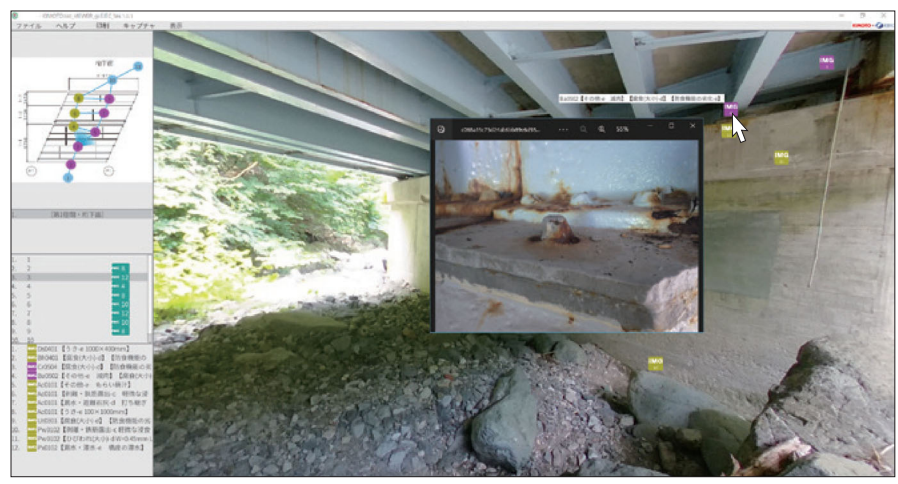
Clicking on the icon will open the attachment and give you a detailed look at the photos and data.

In the Editor version (paid), you can attach various files (JPG, CAD, PDF, MOV, Office-related software, etc.) to the necessary places on the spherical image, so you can incorporate detailed information. Click on the file icon on the spherical image to open the attached file and check the contents. The color and shape of the file icon can be freely changed, so the type and importance are visually expressed in an easy-to-understand way.